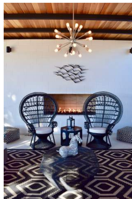
Stunning lounge areas.