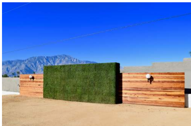
Large artificial boxwood hedge with redwood fencing make the perfect backdrop for your event.

The Ranch House- was built in 1957 and has been lovingly restored by the owners and designers of The Lautner. The home is impeccably furnished and offers your guests a place to lounge either inside the home or outside at its two large lounge areas. There is an enormous redwood and steel pergola with an outdoor fireplace and an open air lounge area with string lights and fire pit. Your event staff will love the use of our Green Room to set up for your big event and there is a detached lobby area with two public restrooms. The home opens up to The Park and the The Lautner making it the perfect extension of our guest services and amenities that we can offer you.