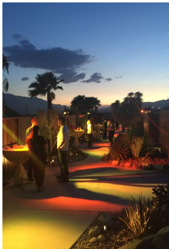
Dazzle your guests with dramatic lighting throughout the hotel grounds.

The Lautner- offers a dramatic and unique architectural setting for your special event. For those more interested in a small event for up to 50 guests seated or more standing, our hotel grounds are ideal. Imagine an intimate event amidst candle lit walkways, desert landscaping and stunning views of the St. Jacinto Mountains. The property is comprised of four upscale luxury units that can accommodate up to 8 VIP's and tours can be arranged to showcase the property to your guests. Our staff can assist you with finding lodging for the remainder of your guests locally in Desert Hot Springs. These local spa hotels offer hot mineral springs, which is exactly what our little town is known for. Or if you prefer neighboring Palm Springs, only a 15 minute drive away, we would be more than happy to assist you. Shuttle and limousine services can also be coordinated on your behalf to get your guests home safe after the big event. Valet service can also be coordinated if you prefer your guests to drive themselves. Ultimate exclusivity lies over tall walls and behind beautifully crafted doors, inside an esteemed architecturally significant property which boasts four luxury accommodations perfect for your VIP's in a compound to call their own.