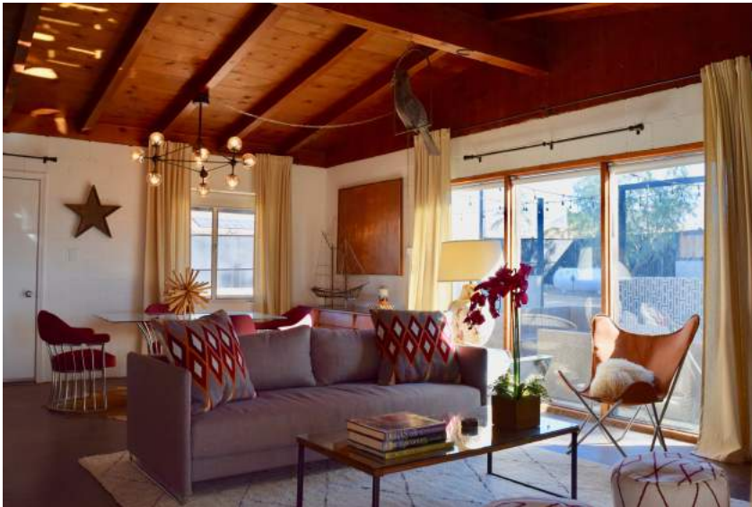
The Ranch House Living Room.