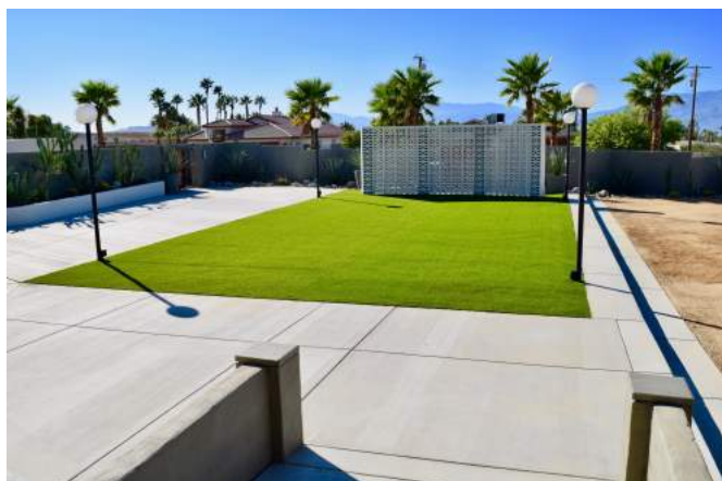
Large expanse of concrete pathways and artificial turf allow you to design the perfect event.